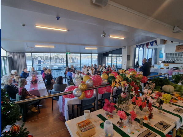
Parua Bay Garden Club